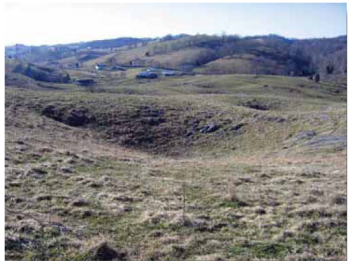
Figure 1. Sinkhole in Russell County, Virginia

There are three types of potential problems associated with the existence or formation of sinkholes: subsidence, flooding, and pollution. Sinkholes are the result of differential subsidence of the land surface. The term subsidence is commonly used to imply a gradual sinking, but it also can refer to an instantaneous or catastrophic collapse.