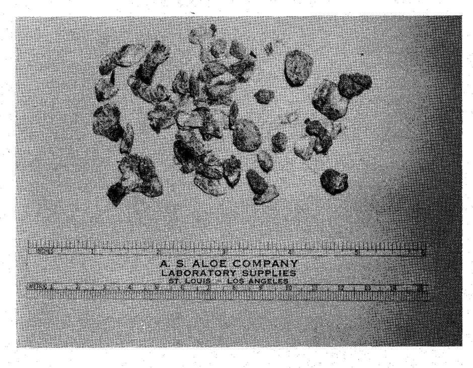
Plate 1. Crude vermiculite before expansion.