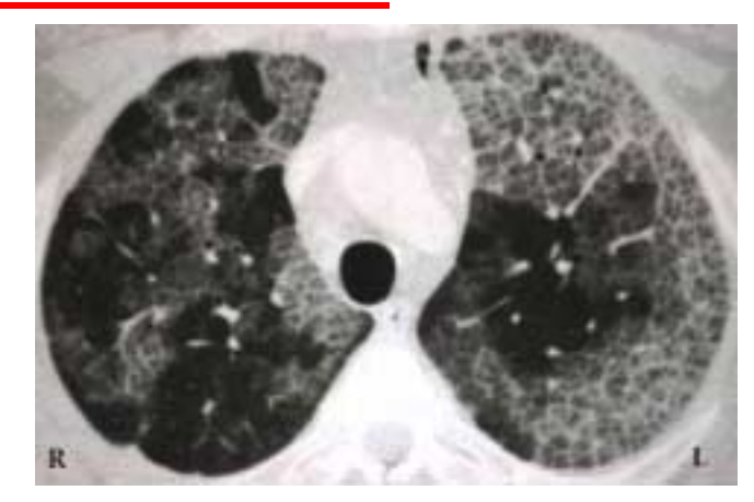
X-rays of a miners lungs damaged by dust containing silica.

SILICOSIS is a disease that is commonly associated with the coal mining industry. This disease occurs as a result of prolonged breathing of dust containing silica (quartz). Quartz is the main substance in sand and sandstone rock. Breathing quartz laden dust will yield the same effects as breathing fine glass particles. Silica dust develops scar tissue inside the lungs which reduces the lungs ability to extract oxygen from the air.