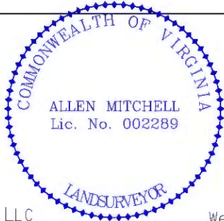
EXHIBIT A OAKWOOD FIELD UNIT T7 FORCE POOLING VGOB-17-0117-4105

Company CNX Gas Company LLC Well Name and Number UNIT T7 Tract No. _____ Elevation _____ Quadrangle VANSANT County BUCHANAN District PRATER Scale: 1" = 400' Date 12/7/16 This plat is a new plat X ; an updated plat _____ ; or a final plat _____